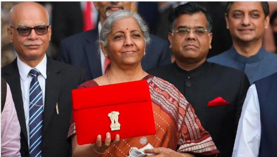
The Finance Minister announced a new programme to promote research and innovation in pharmaceuticals that will be taken up through centers of excellence

Considering the need of research and development (R&D) and innovation in pharmaceuticals, already identified as a sunrise sector amidst Covid-19 pandemic, Union Finance Minister Nirmala Sitharaman made big