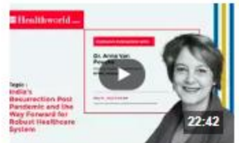
India's Resurrection Post