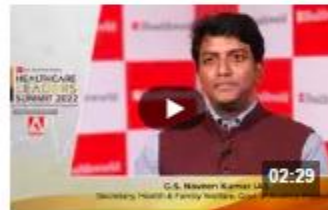
Andhra Pradesh is an 'emerging' destination for healthcare startups and unicorns