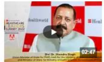
Pandemic Reinstated the Power of Biotechnology