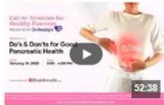
Do's and Don'ts for good pancreatic health