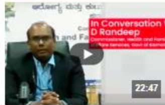
Promotive and Preventive Healthcare Key Focus of Karnataka Govt