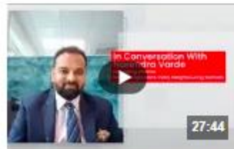
Providing advanced diagnostics