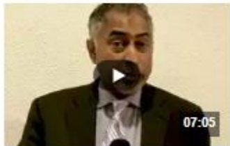
Digital Therapeutics improving diabetes management in patients