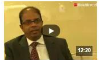
Google building robust digital health solution for connected care