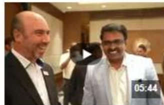
FUJIFILM Sonosite celebrates 15 years of excellence in India