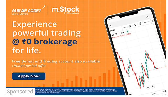
Open your Demat & Trading A/c for Free today