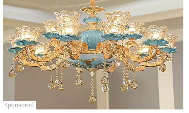
Gurugram Ceiling Light Finally On Clearance: Price May Surprise You Ceiling Light | Sponsored Listings