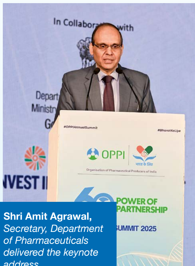
Shri Amit Agrawal, Secretary, Department of Pharmaceuticals delivered the keynote address